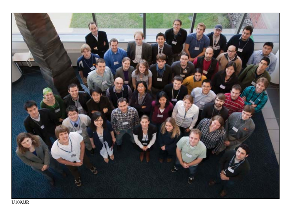
Figure 124.47 A total of 45 students and postdoctoral fellows attended and made 31 engaging presentations.

A wide-ranging series of 76 talks and posters were presented over a two-day period. In the morning sessions, invited talks covered the facility and science. The invited science talks focused on several important topics, including high-energydensity plasmas, laboratory astrophysics, ignition in inertial confinement fusion (ICF), the physics of fast ignition, and future experiments on OMEGA and the NIF.